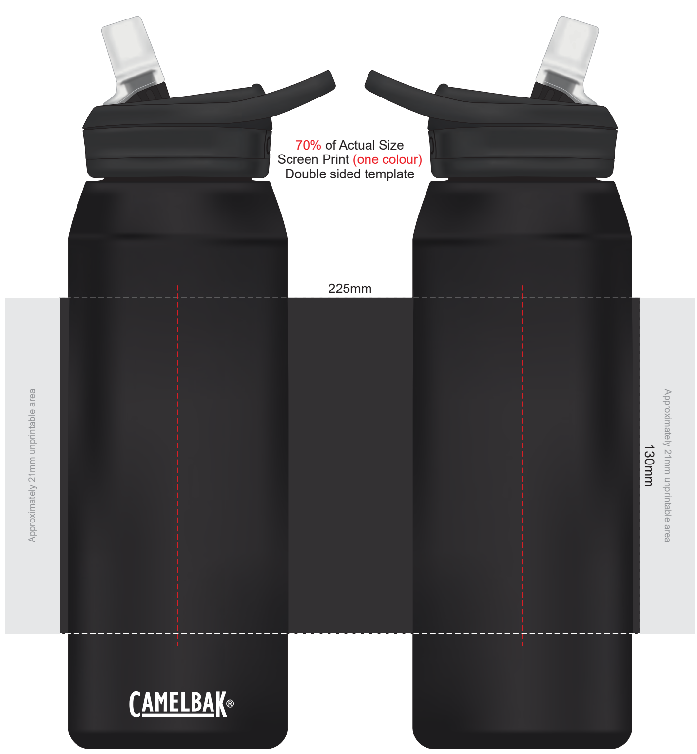
A 2-3mm tolerance is expected for alignment of the printed artwork and the CamelBak logo.