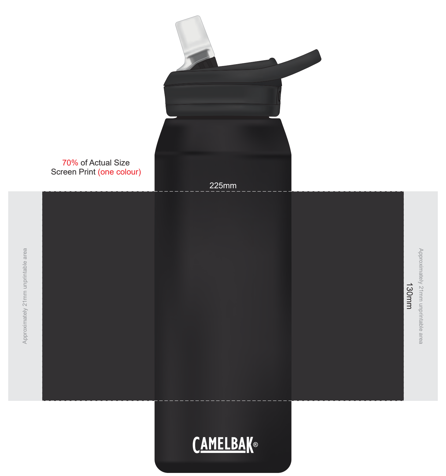
A 2-3mm tolerance is expected for alignment of the printed artwork and the CamelBak logo.