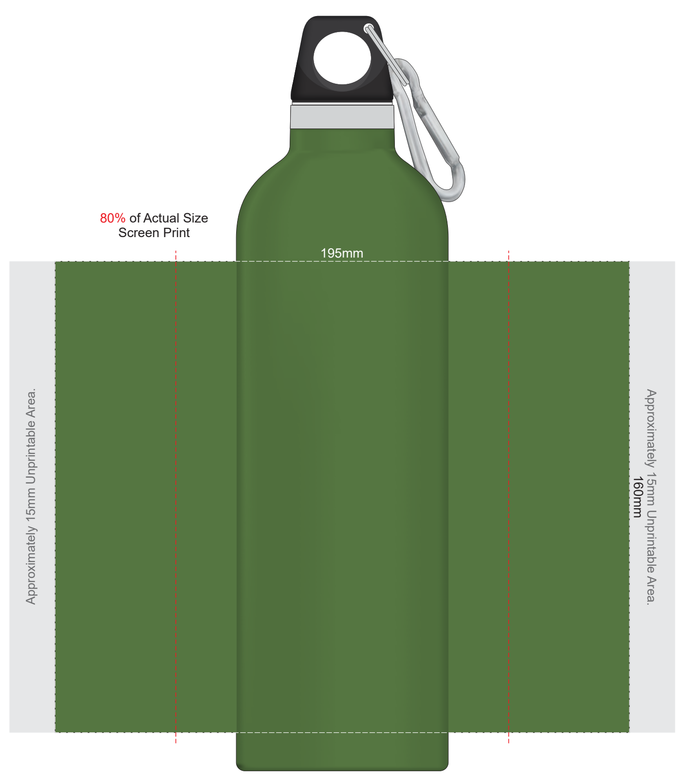
Red Line = Exact opposites of the product (centre artwork to the red line)